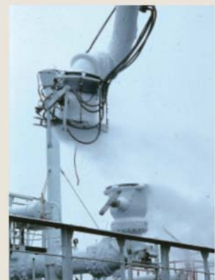
3 ERC opens and finishing separation