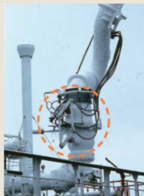
2 Two valves shut completely