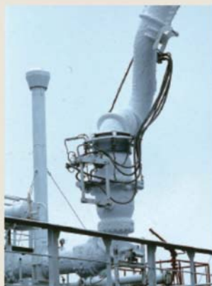
1 Start separating

Niigata Loading Systems has successful ERS delivery records for different kinds of fluids and gases and since the first installation in 1982, all of the LNG loading arms supplied in and outside Japan are equipped with this unit.